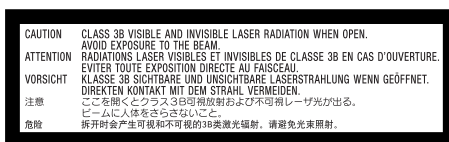
Located underneath keyboard