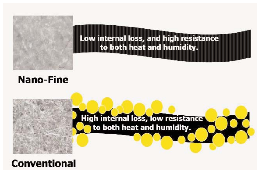
Nano-Fine vs. Conventional