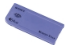
MSA-4A/8A/16A/32A/64A IC Recording Media Memory Stick