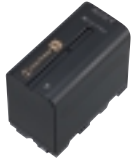
NP-F550/NP-F750/ NP-F960 InfoLITHIUM Rechargeable Battery Pack

Some of the following accessories may not be available in certain countries. For details, please contact your nearest Sony office.