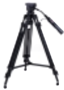
VCT-1170RM Video Tripod with Remote Control