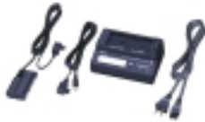
AC-VQ800 Battery Charger