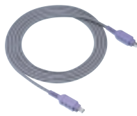
VMC-IL4408/4415/4435 (4-pin to 4-pin) VMC-IL4615/4635 (4-pin to 6-pin) i.LINK Cable