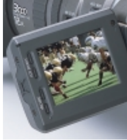
* Simulated picture

The DSR-PD150 has a high-resolution color LCD monitor for viewing the recording picture, or checking the playback picture on location. With its large screen, it is helpful in setting the menu or audio recording level, as well as monitoring the camera and audio status while mounted on a tripod.