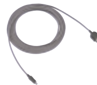
CCFD-3L (4-pin to 6-pin with lock) i.LINK Cable