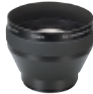
VCL-HG1758 Tele Conversion Lens 1.7x