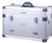
LCH-VX2000 Hard Carrying Case for DSR-PD150/PD150P