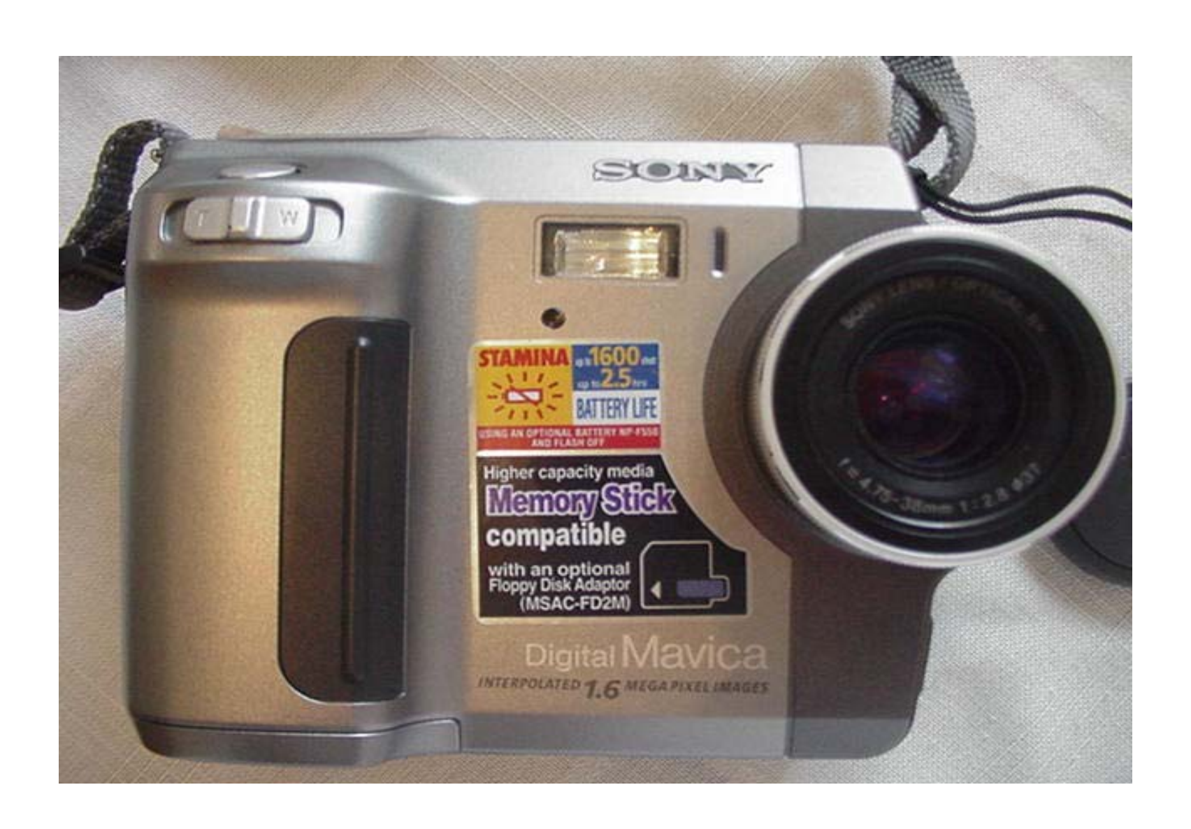
Front of the 90