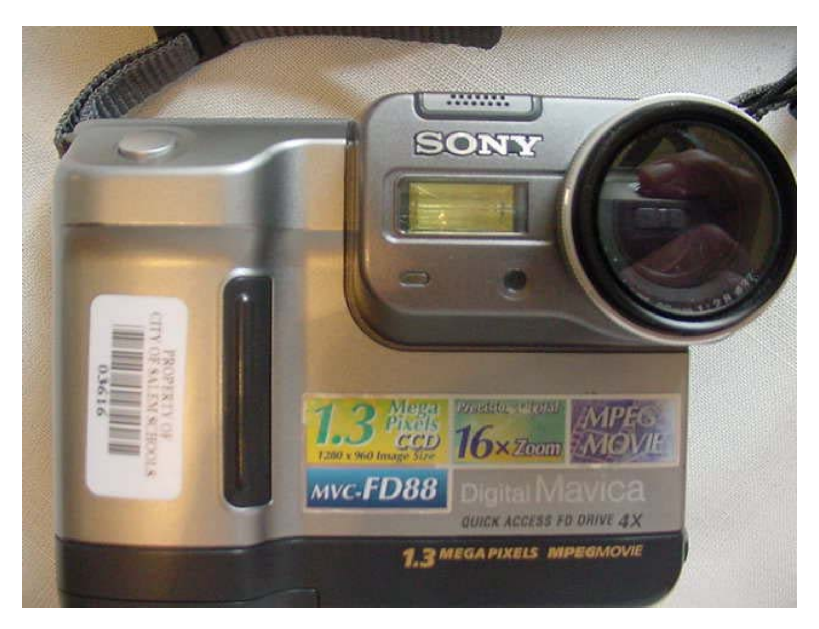
Front of the 88