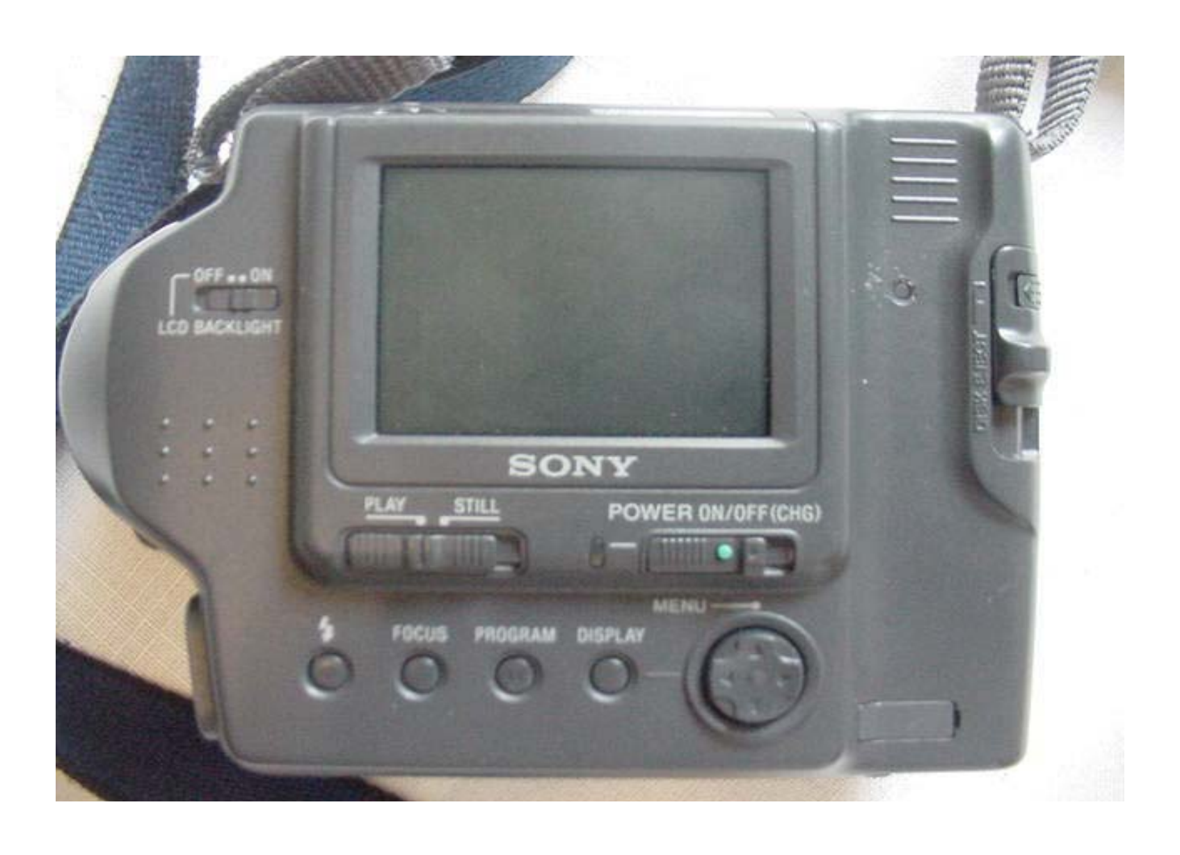
Back of 87