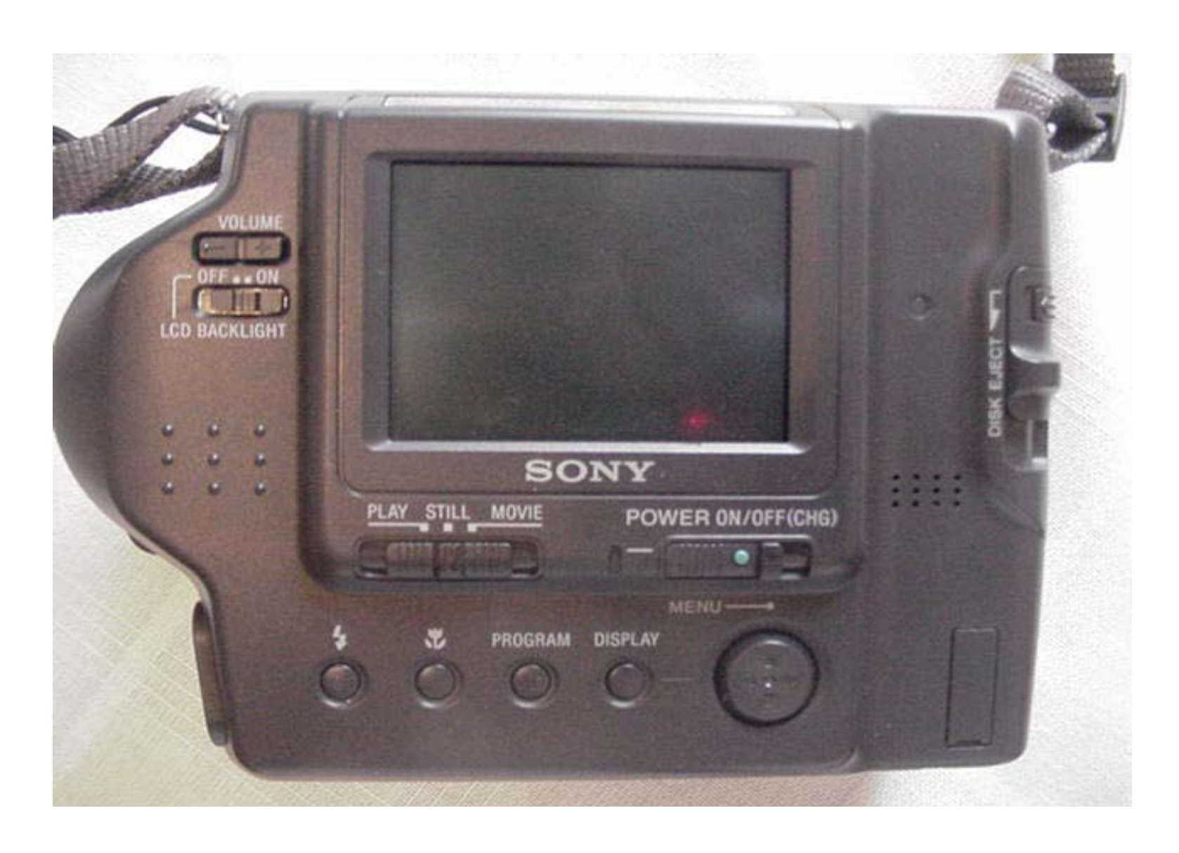
Back of 90