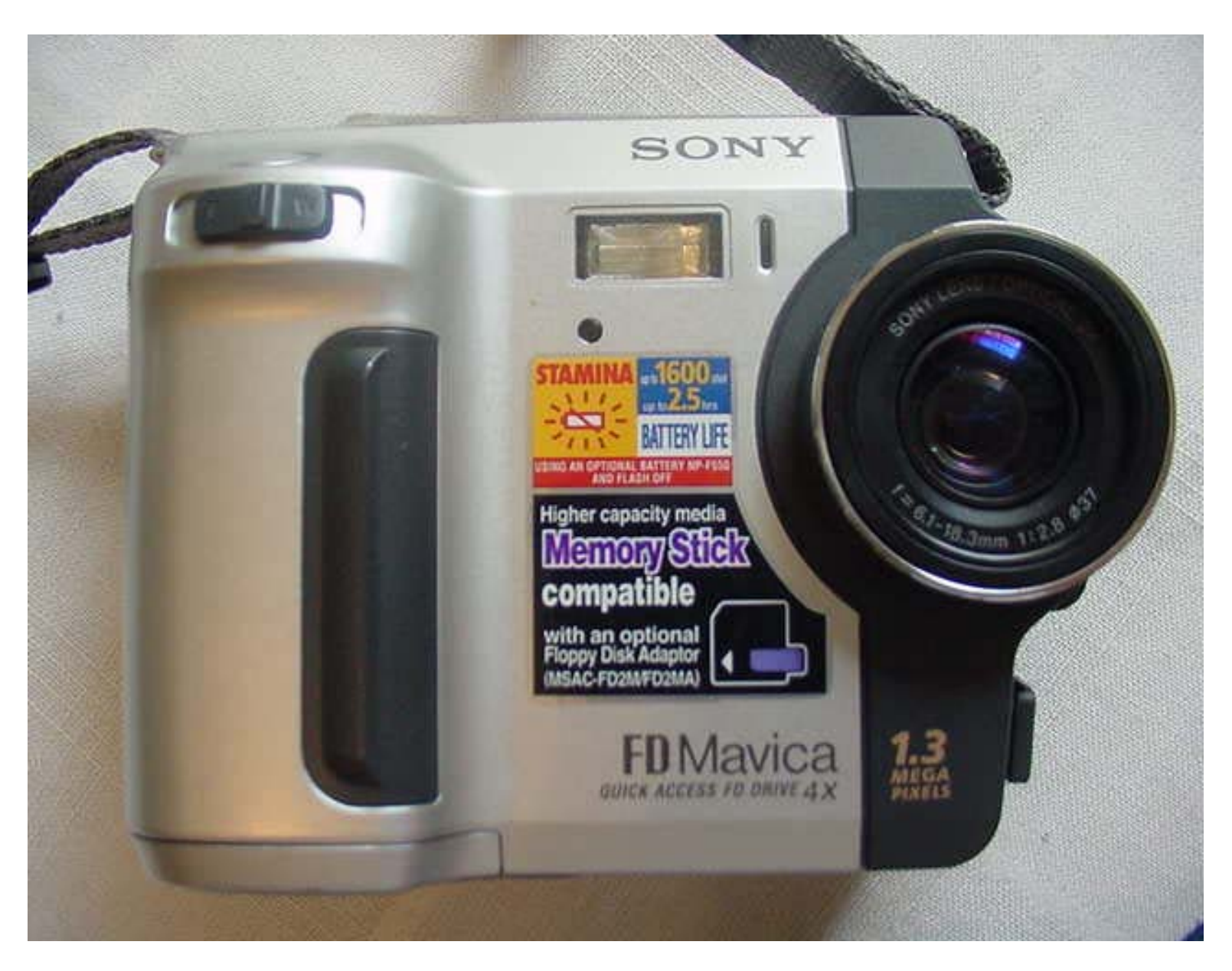
Front of the 87