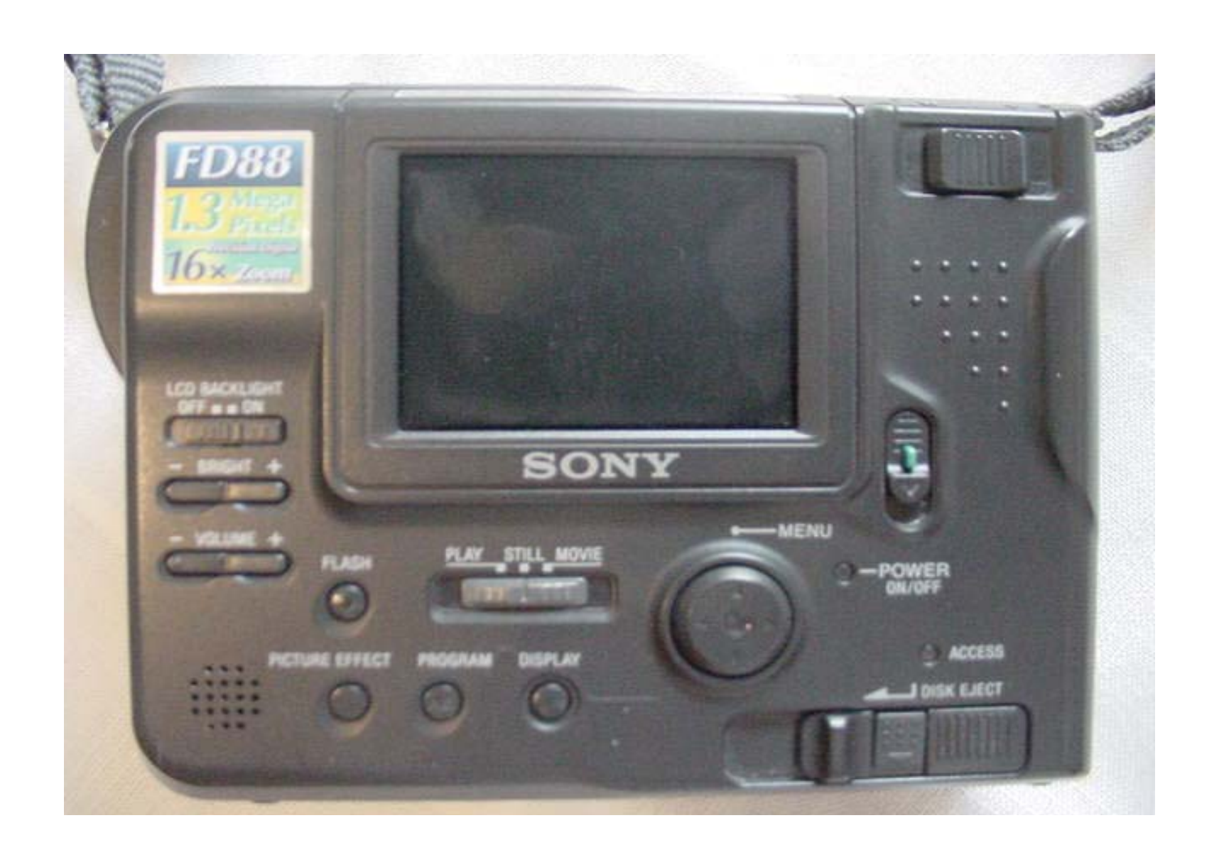
Back of 88