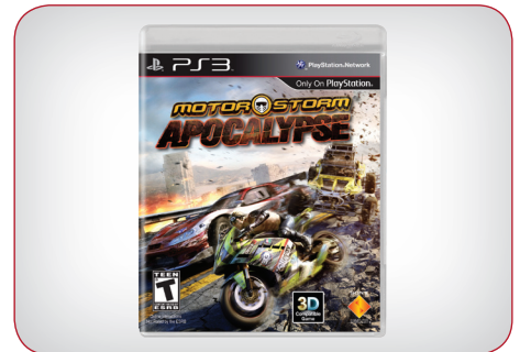
PlayStation® 3D Glasses and MotorStorm®: Apocalypse Game Included