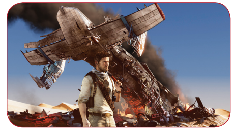
UNCHARTED 3: Drake's Deception™