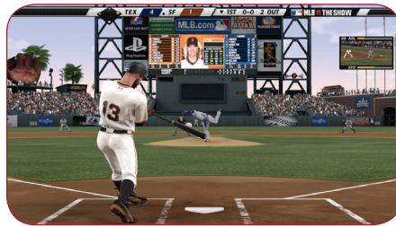
MLB® 11 The Show™