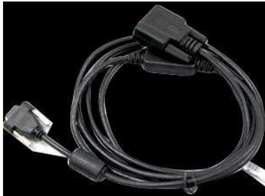
Fig. 3.11 - Communication cable between Psion and receiver

Inside the Psion bundle there is also a cable used for connecting Psion and receiver, in case of malfunctioning of Bluetooth device. See Fig. 3.11.