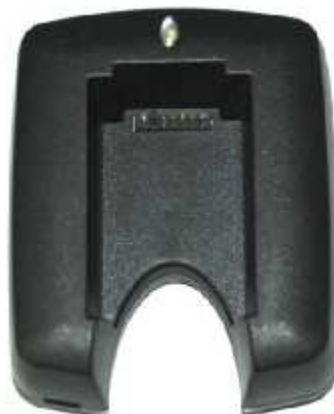
Fig. 3.6 - Psion charger