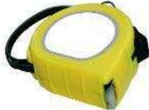
Fig. 3.16 - Measuring tape

On the basis of the configuration chosen (base or rover) some of these accessories are included or not in the receiver bundle.