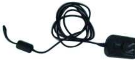
Fig. 3.5 - Psion adaptor