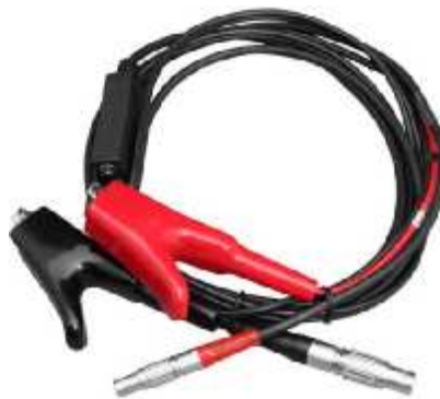
Fig. 3.7 - External power supply cable

It is used to connect the base mainframe (red), transmitting radio (blue) and connect the accumulator (red and blue clip). It has the function of power supply and data transfer .(Fig 3.7)