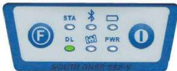
Fig. 2.8 - S82V Data Link LED

In static mode, it will remain lit in normal operation conditions. In RTK mode, it shows if the data link module working in good condition.