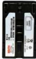
Fig. 3.2 - Lithium-ion battery

The standard configuration contains two batteries and a slot for charging batteries (named “charger” for simplicity) and an adaptor. The batteries are “lithium-ion” batteries: a technology which has a high energy-to-weight ratio with respect to NiCd or NiMh batteries, lack of memory effect, and slow self-discharge when not in use.