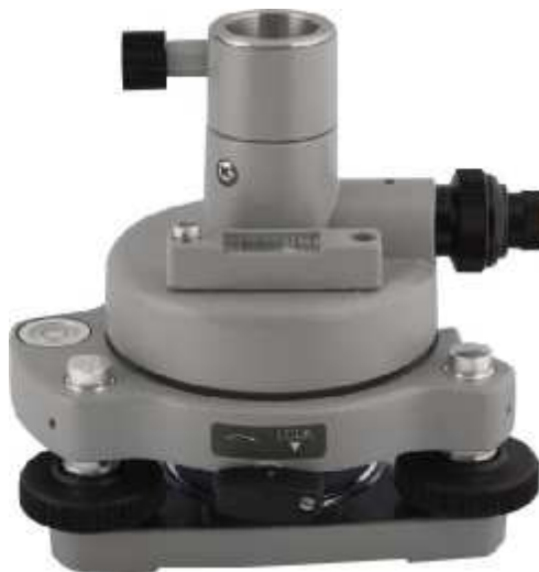
Fig. 3.14 - Tribrach and adapter with optical plummet