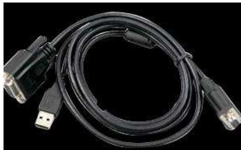
Fig. 3.10 - Multi-function communication cable

Multi-function communication cable: this cable is used for connecting receiver and computer used for transfer the static data, update of firmware and the license. It can also be used for connecting GEOS controller and receiver, in case of malfunctioning of the Bluetooth device. See Fig. 3.10.