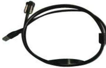
Fig. 3.8 - USB communication cable for Psion

USB communication cable is used for connecting handheld and computer, using the software Microsoft ActiveSync if you use Windows XP or an earlier version, or Windows Mobile Device Center if you use Vista or Windows 7 (you can free download these programs from Microsoft website). There are different cables for different controllers.