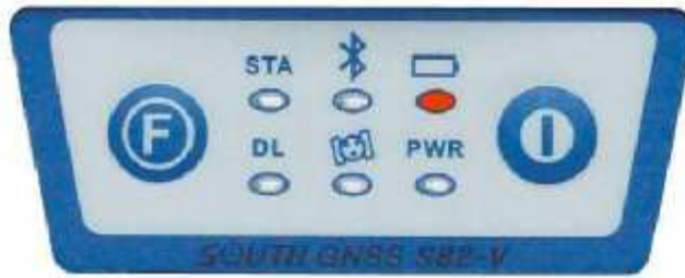
Fig. 2.12 - S82V battery power LED