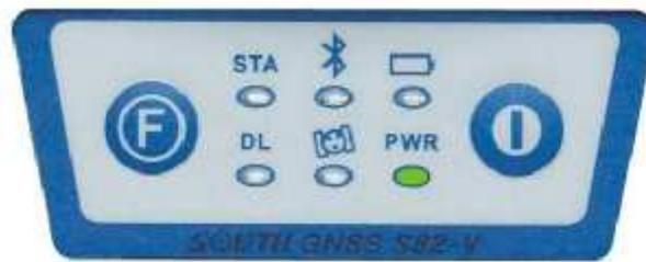
Fig. 2.4 - S82V external power LED

BT (red): Bluetooth indicator light (Fig. 2.5).