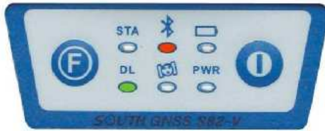
Fig. 2.13 - Bluetooth and DL LEDs