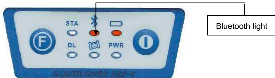
Fig. 2.5 - S82V Bluetooth LED

When the controller is connected with the receiver, this light will light up.