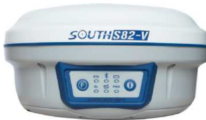
Fig. 2.1 - S82V main unit

structure. The cover protects the GNSS antenna inside. The protective rubber ring has the function of additional protection against water and dust. The display LED panel and control keys are integrated into front of the main structure. On the bottom there is a slot for the built-in a compartment for the batteries. All the others components of the receiver (Bluetooth device, main board, etc.) are contained inside the main structure of the receiver.