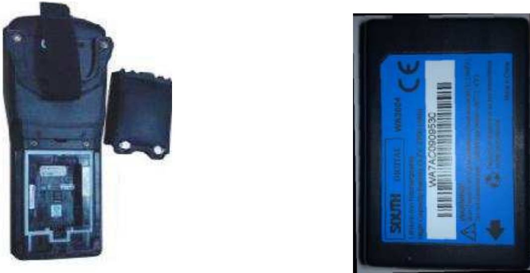
Fig. 3.4 - Psion battery