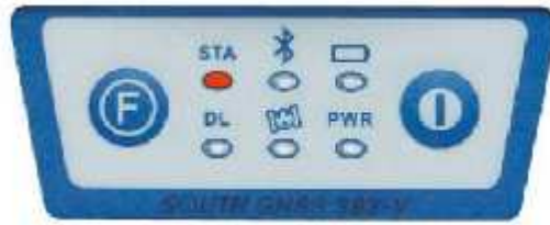
Fig. 2.3 - S82V battery power LED

PWR (green): external power supply light (Fig. 2.4).