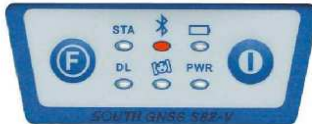
Fig. 2.10 - S82V Bluetooth LED

Base mode: When the BT light blinks, press P key to confirm, you will enter base mode. The following display shows the receiver in base mode: