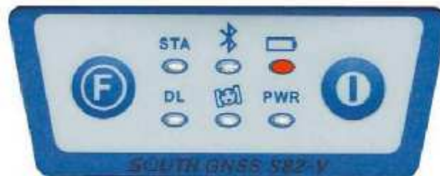
Fig. 2.11 - S82V battery power LED

Static mode: When the BAT light blinks, press P key to confirm, you will enter static mode. The following display shows the receiver in static mode: