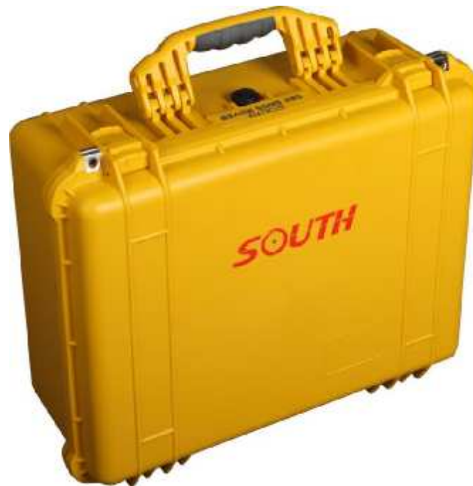
Fig. 3.1 - S82V case