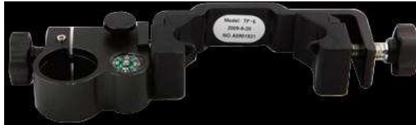
Fig. 3.13 - Bracket for controllers