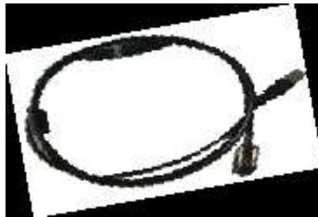
Fig. 3.9 - USB communication cable