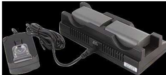
Fig. 3.3 - 82V charger and adaptor

The charger can charge both batteries simultaneously. The lights of the charger show if a battery is being charged or if it's already charged.