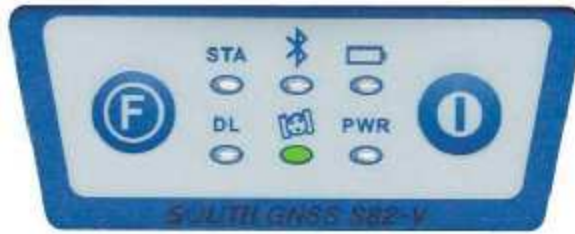
Fig. 2.6 - S82V satellite LED