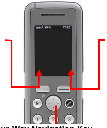
Four-Way Navigation Key Use the key to move around in menus. The four lines on the key illustrate the directions you move when pressing the key.

Use left softkey to enter main menu. When in menu, use