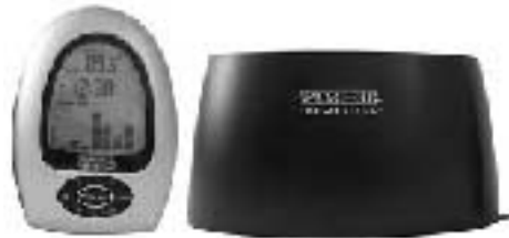
Base Unit Rain Collector/Remote Sensor