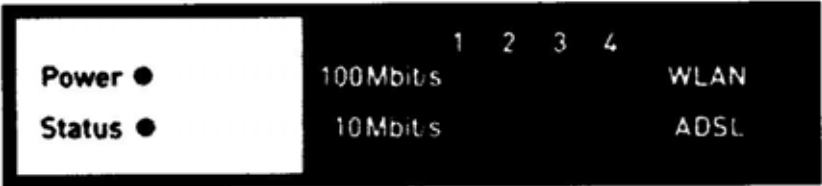
Illustration 2 Front Panel

The LEDs on the front panel indicate the state and activity of the appliance.