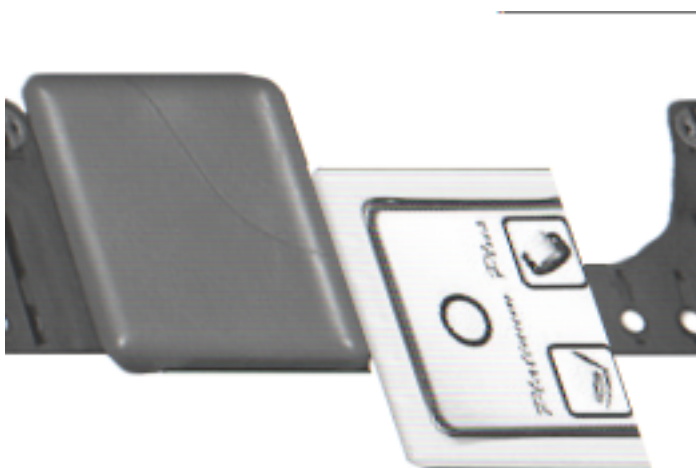
Figure 2 : Resetting a PID

The strap sever, PID tamper and case open alarms have the ability to remember if the alarms were ever activated. This will ensure that should the participant tamper with the PID while away from the area of confinement the alarm will be reported upon return. These parts of the PID circuitry need to be reset upon initial installation by using a LOCK. The PID button on the LOCK is used to reset the alarms. Simply place the LOCK against the reset point (See Figure 2 : Resetting a PID) on the PID and press the PID button once. The LOCK will emit a special signal (while the red light is on) and reset the circuitry. See Page 36 for more information regarding Special Function Mode use of a LOCK.