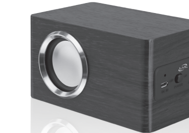
Portable Wireless Wooden Speaker User's Guide for Model No. ISB135RW v1283-01