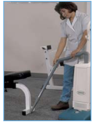
The built-in vacuum hose on the 3220 provides powerful lift and allows the operator to clean in hard to reach areas.

Tennant offers a wide range of vacuums and sweepers designed to help you maintain floors more productively. The 3000 Series of vacuums and sweepers can be customized with accessories to fit your exact cleaning needs.