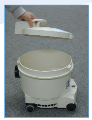
The base mounted motor on the 3400 provides a low center of gravity and prevents tipping. An easy to remove lid allows for quick access to the 8 L dust-free flanged bag.