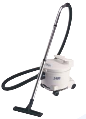
The 3400 canister vacuum is ultra quiet at 58 dBa and triple filtration provides 99.99954% efficiency to 0.3 micron for environmentally sensitive areas. Other features include an 8 L bag capacity, a dual purpose floor tool and a built in crevice tool.

So remember the Tennant 3000 Series of vacuums and sweepers when it comes to any of your floor cleaning needs.