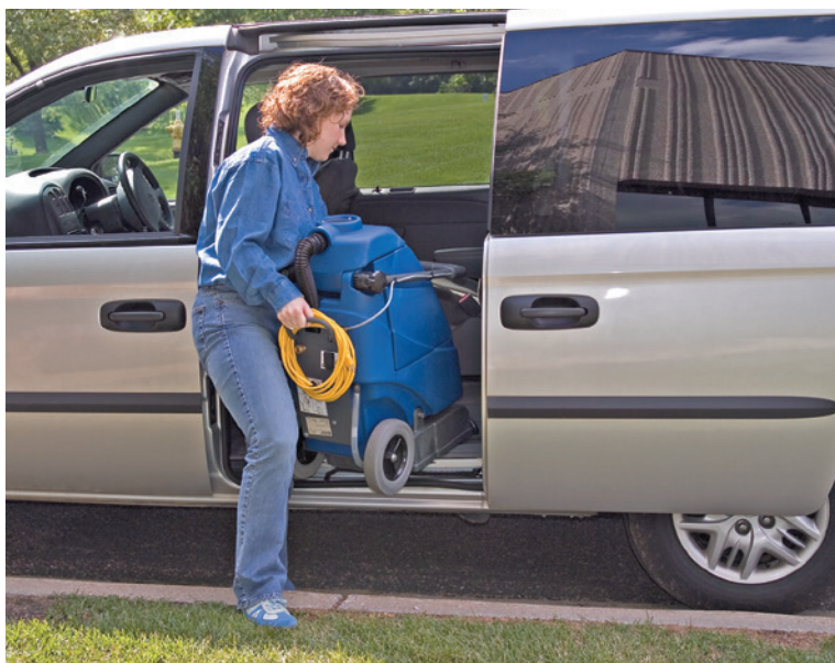
Hand grips and compact folding simplify easy lifting and transport.