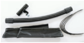
Dust Containment Kit