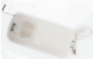
Solution Tank Kit