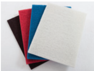
Various Scrub Pads