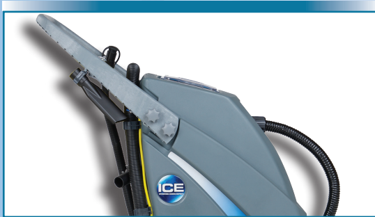
Ergonomic, adjustable handle designed for operator comfort