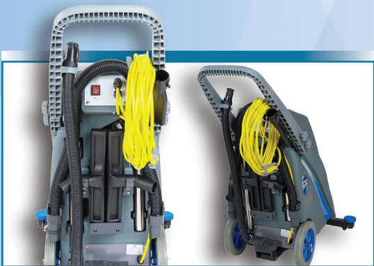
5-piece contractor tool kit included with on-board tool storage and cord wrap for convenient access