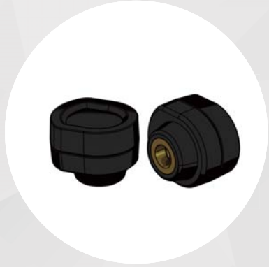
Quick Installation Guide