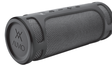
RUGGED STEREO BLUETOOTH® SPEAKER 4000770 User's Guide

We hope you enjoy your AUVIO Rugged Stereo Bluetooth Speaker with True Wireless stereo sound capability. Tough and water-resistant, this speaker is ideal for outdoors. It's also designed with a built-in mic and speakerphone so you can take calls as well as listen to music from your smartphone. Please read this user's guide before using your new speaker.