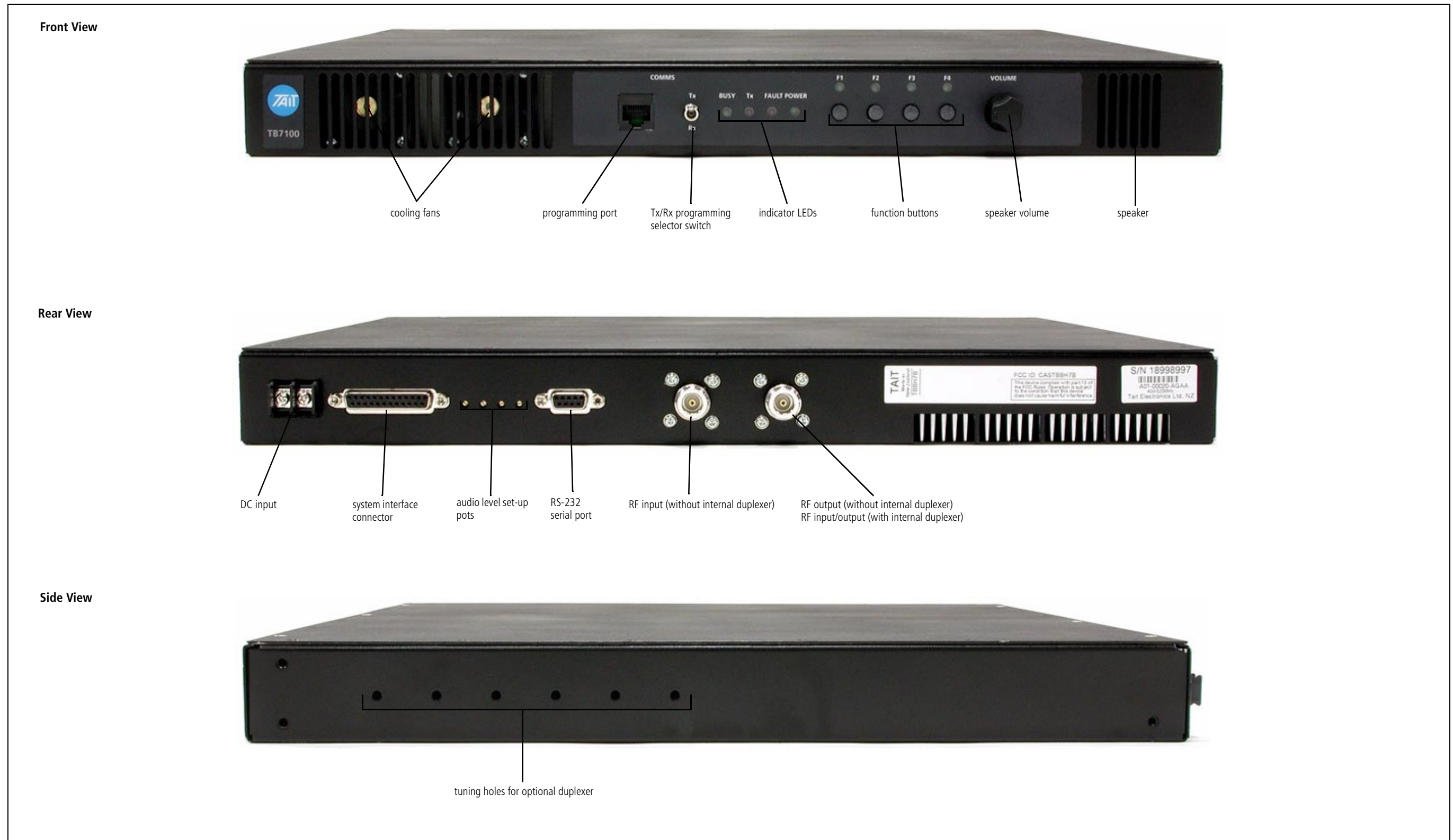
Figure 2.1 TB7100 base station controls and connections