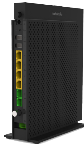
TG1700(d)ac back panel

TECHNICOLOR WORLDWIDE HEADQUARTERS 1, rue Jeanne d'Arc 92443 Issy-les-Moulineaux France Tel: +33 (0)1 41 86 50 00 - Fax: +33 (0)1 41 86 58 59