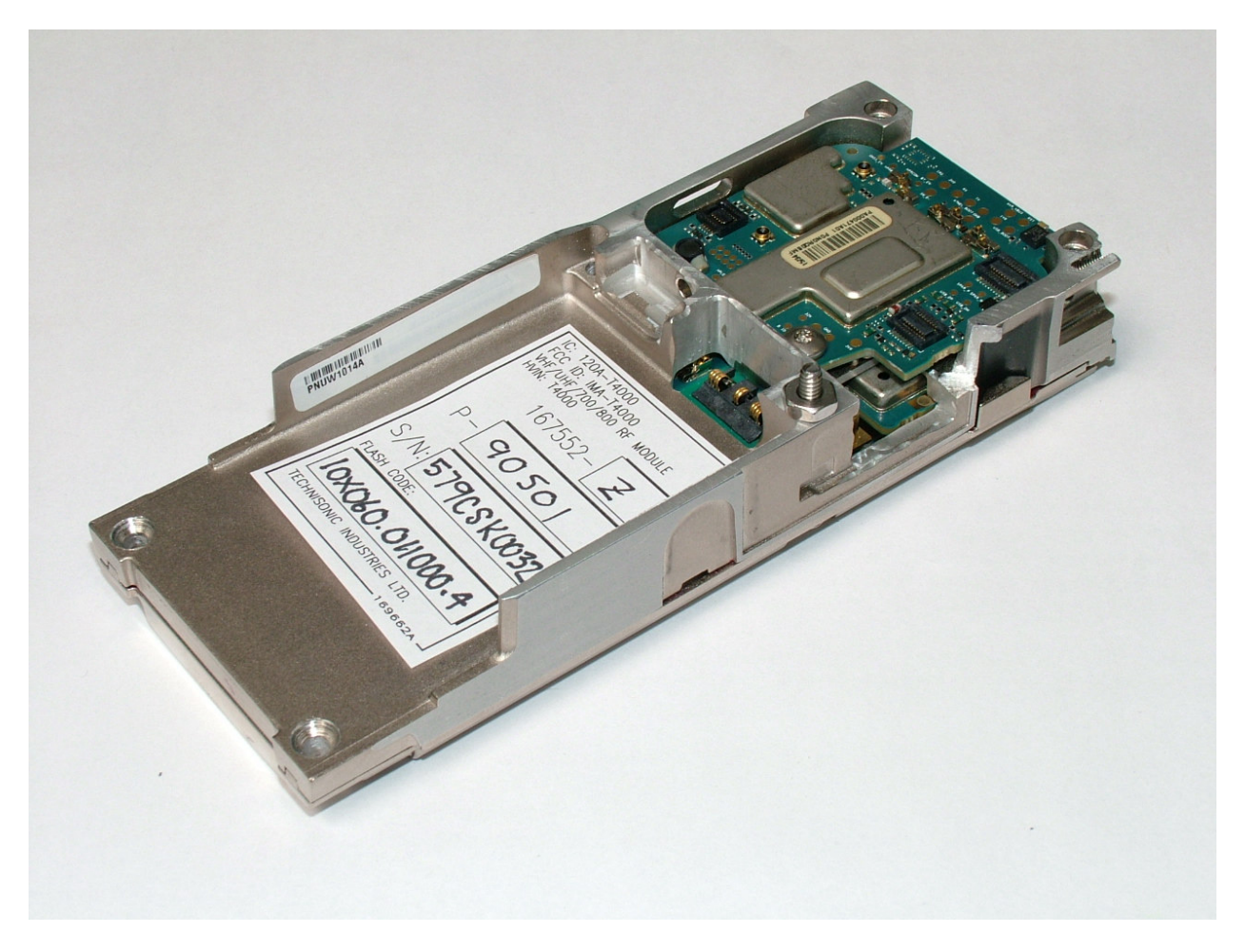
FIGURE 1: Overall view of the T4000 RF Module

The RF module is capable of operating on Analog FM, Wide and Narrow and Project 25 Phase 1 conventional and P25 Trunked Phase 1 and 2 systems.