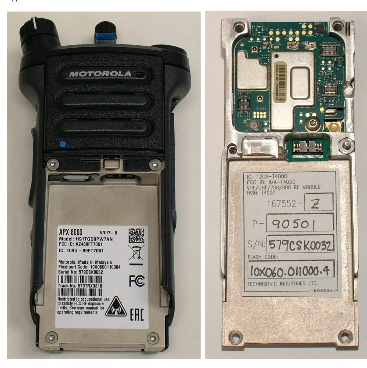
FIGURE 2: APX 8000 FCC ID (Left), Right T4000 Module with new FCC ID applied

The T4000 RF module is a modified Motorola APX 8000. Part of the modification requires removal if the original Motorola FCC ID label. After all modifications are done the new Technisonic FCC/IC ID label is applied.