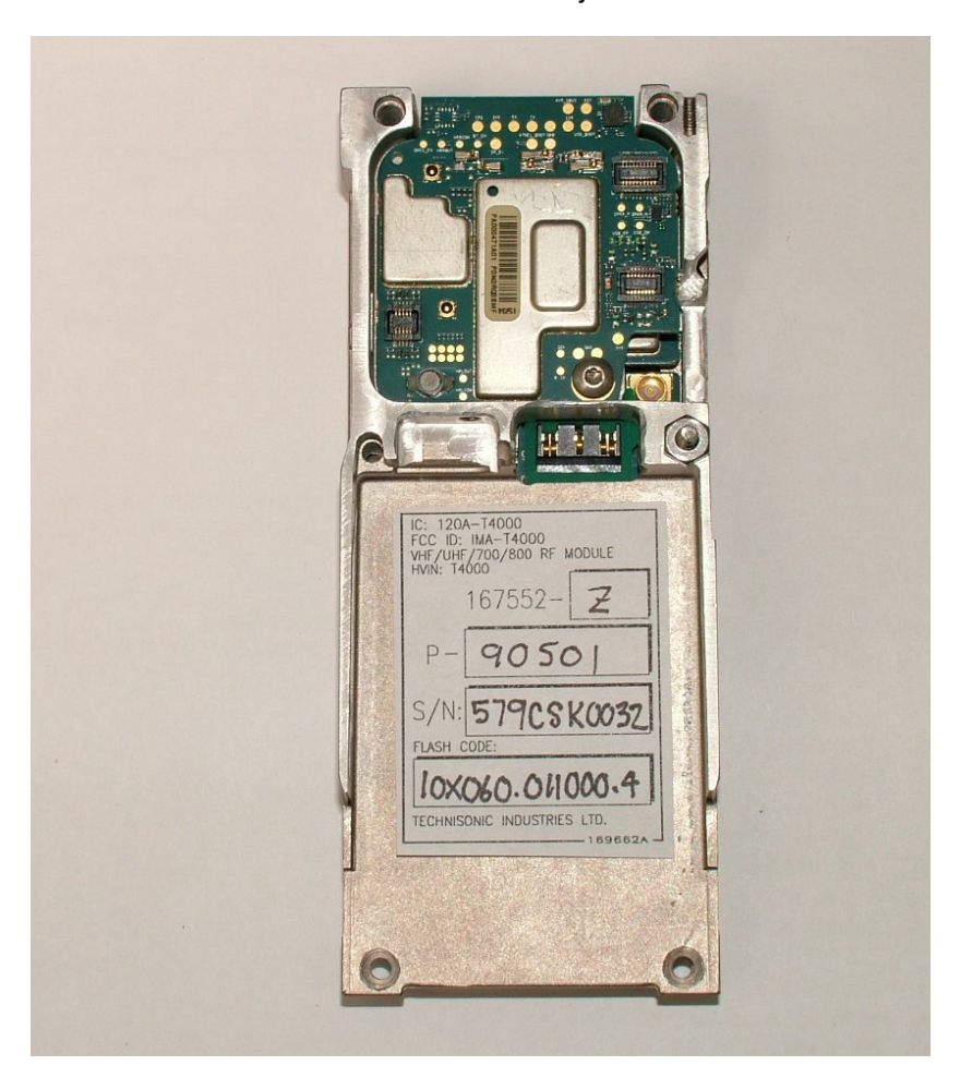
FIGURE 4: FCC/Industry Canada Label placement on the T4000 Module

The T4000 is intended to be mounted in the TDFM 9000 chassis and is not visible. Therefore, a second label must be applied to the outside of the TDFM 9000 that contains the following text: "TDFM 9000 Multiband Transceiver. Contains Module: FCC ID IMA-T4000".