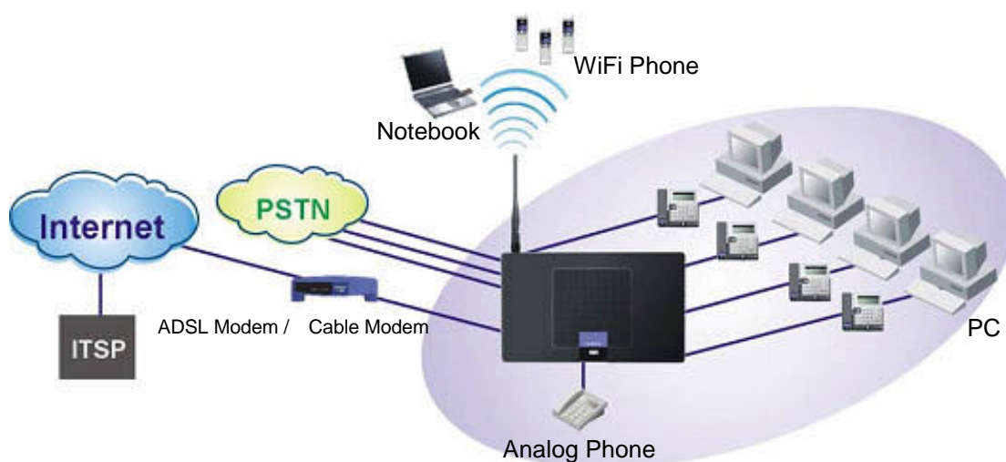
Router Connection Diagram

The IG (Intelligent Gateway) provides a variety of functions for users and can support a wide range of application in a complicated environment. Therefore, it needs Administrator to plan, install and set the whole environment of VoIP communication. And the knowledge of modern network and Internet technologies are essential for administrator.