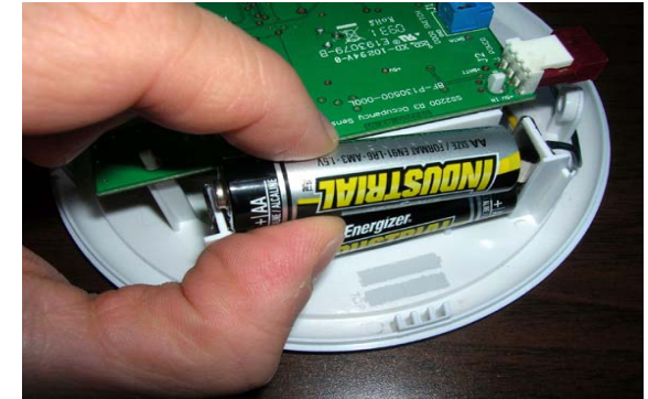
Figure 4 - Inserting Batteries

Ensure that there is nothing in between the battery terminals and the battery clips, such as stray insulation, paint chips, etc. The battery terminals must make firm, conducting contact with the battery clips.