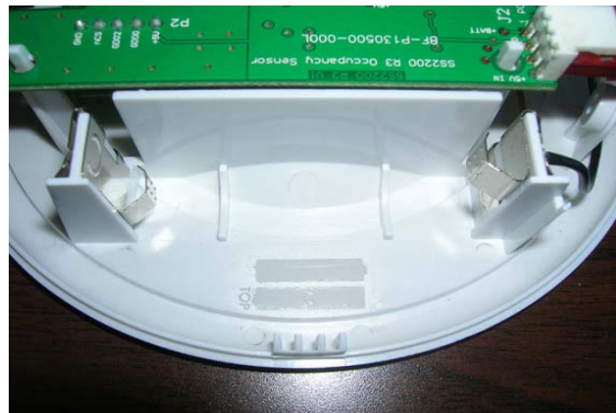
Figure 3 - Battery Orientation and clips

Dispose of used batteries in a safe and approved manner.