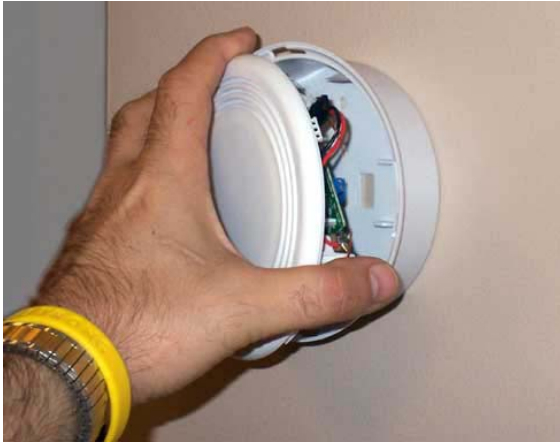
Figure 1 - Removing the Sensor from the Mounting Plate

Step 1: Remove the retaining screw, and rotate the Sensor faceplate until it disengages from the mounted base.