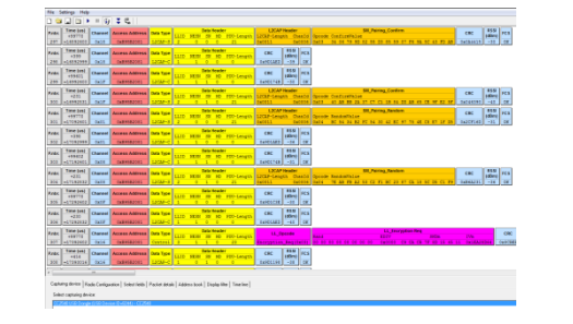
The SmartRF Protocol Packet Sniffer software can be downloaded at <u>www.ti.com/packetsniffer</u>