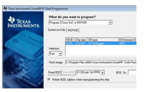
SmartRF Flash Programmer can be downloaded at <a href="http://www.ti.com/tool/flash-programmer">www.ti.com/tool/flash-programmer</a>

Texas Instruments has a simple tool which can be used to program and flash the CC2540.