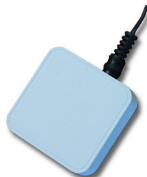
Router / Coordinator