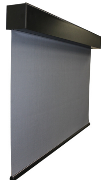
Crystal Connect Roller Shade