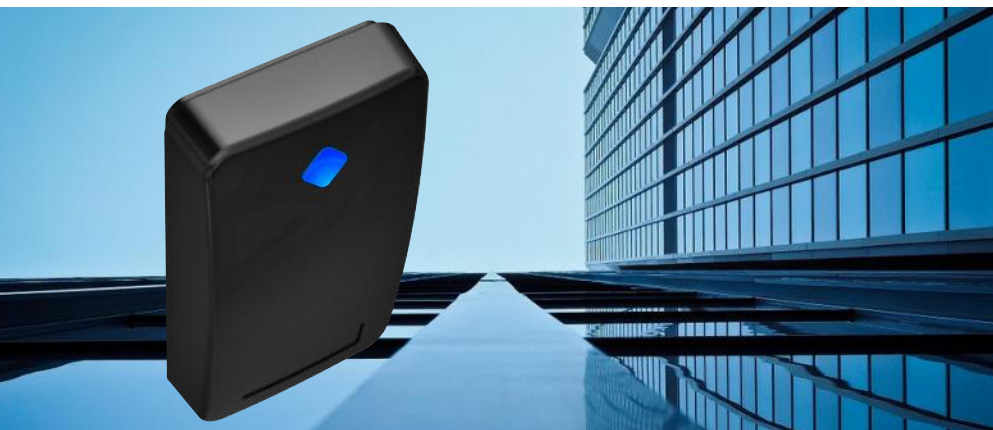
Images shown in this document are for illustrative purposes only. The features, colours, style and appearance may change without notice.

We do our best to provide accurate and reliable information at the time of publication, but due to continuous developments we cannot be held responsible for clerical errors, omissions or outdated information, and we reserve the right to amend, alter or withdraw such information, without notice.