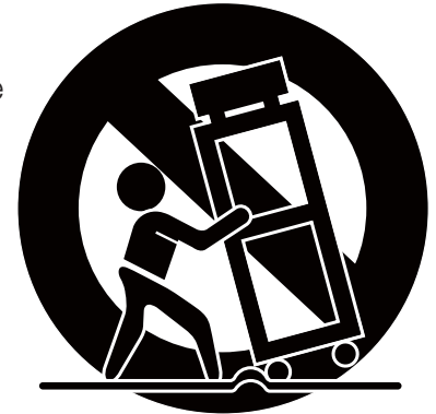
Portable Cart Warning