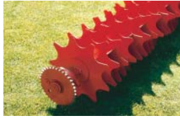
Rake-O-Vac thatching reel