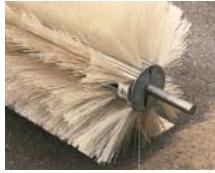
Rake-O-Vac hard surface brush