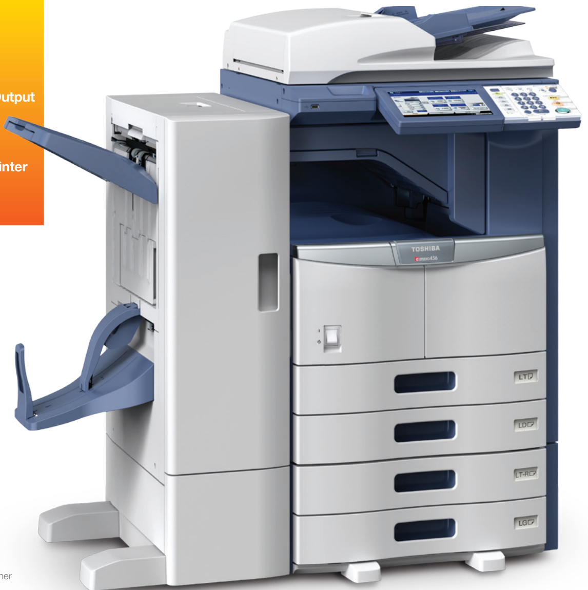
e-STUDIO456 with Saddle-Stitch Finisher