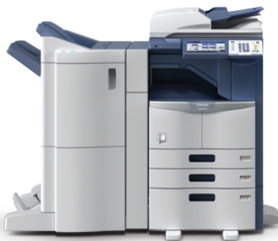
e-STUDIO456 with 2,000-Sheet LCF, Hole Punch, and Saddle-Stitch Finisher.