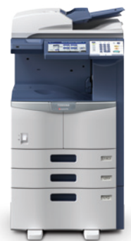
e-STUDIO456 with 2,000-Sheet LCF.