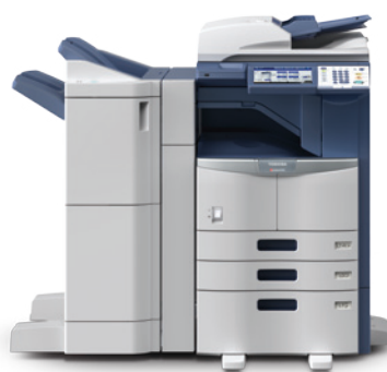
e-STUDIO456 with 2,000-Sheet LCF, Hole Punch, and 50-Sheet Staple Console Finisher.