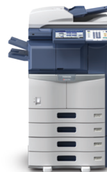
e-STUDIO456 with 50-Sheet Inner Finisher and Hole Punch.