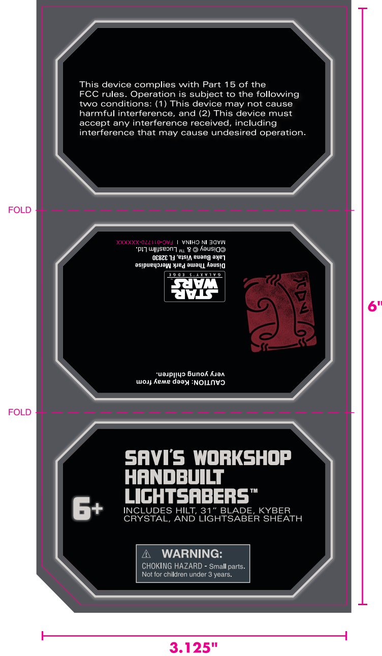
FOLDED - OUTSIDE - OPEN