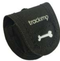
A Carrying Pouch