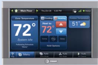
ComfortLink™ II XL950 Control Model No. – TZONE950AC52ZA