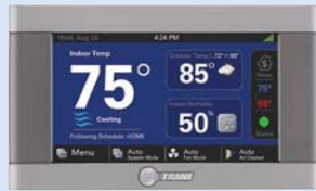
ComfortLink™ XL850 Control Model No. – TCONT850AC52UA