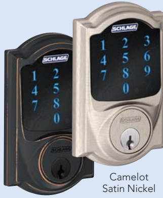
Camelot Satin Nickel