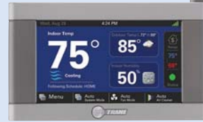
XL824 Control Model No. – TCONT824AS52DA