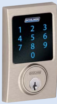
Century Satin Nickel