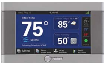
Trane ComfortLink™ XL850 and Trane XL824 Controls