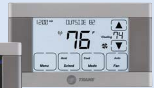
XL624 Control Model No. – TCONT624AS42DA