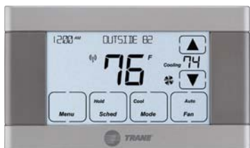
Trane XL624 Control