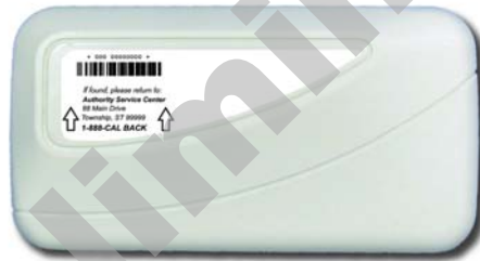
Figure 3 Correct Tag Orientation