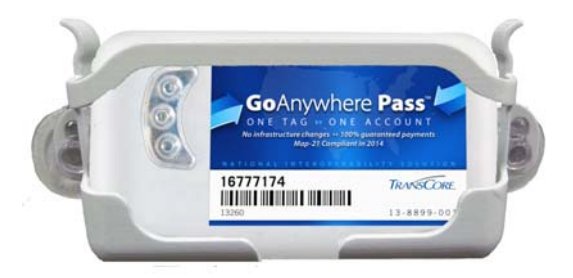
Figure 3 Correct Tag Orientation

6. To remove a tag mounted with Dual Lock strips from the windshield, grip the tag at the top and bottom sides. Gently lift the tag away from the windshield on one end until the tag is free from the windshield. Be careful not to hit the rearview mirror.