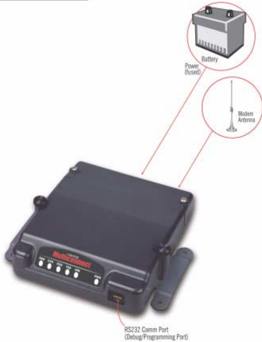
Figure 1: Typical System Schematic