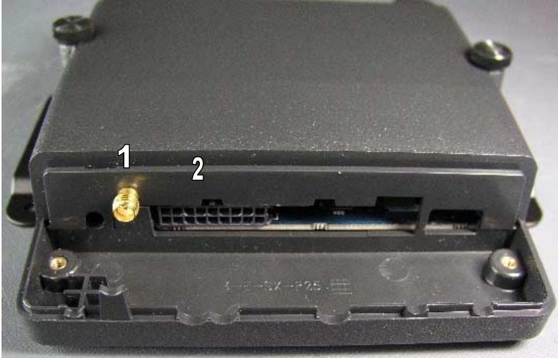
Figure 2: MultiConnect Interface points (Rear View)

The cable cover on the MultiConnect unit can be removed by hand or by using a flathead screwdriver to loosen the two screws. Removing the cable cover gives access to the MultiConnect interface points, which are detailed below.