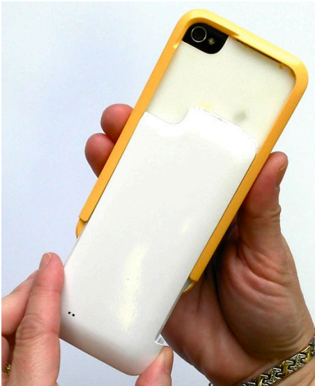
BiKN for iPhone 4

BiKN for iPhone 4 not only protects your phone but prevents the glass back of your iPhone 4 from being scratched.