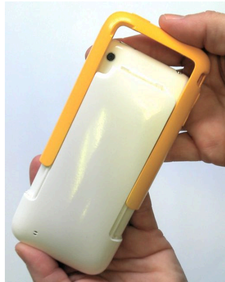
BiKN for iPhone 3GS

To attach clip the inner case on and then push the slider in.