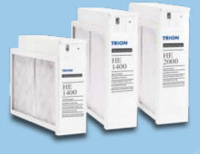
HE Plus 1400

Trion<sup>®</sup> electronic air cleaners easily attach directly to your home's heating and cooling system ductwork, passing recirculated air through the air cleaner. A permanent, washable, aluminum mesh pre-filter captures large particles in the air pulled in by the furnace blower. High-voltage ionization within the Trion® exclusive Forever Filter® purifying cell then attracts and captures the particles on alternately charged aluminum plates, filtering up to 95% of particles as minute as 0.1 micron and preventing harmful irritants from being constantly recirculated.