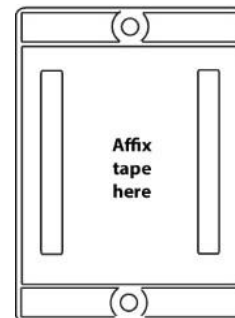
Figure 3: Mounting with double-sided tape