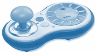
InnoTV™ Controller Model: 2190