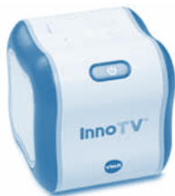
InnoTV™ Console Model: 1836