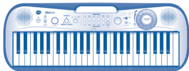
Gini Learning Keyboard™