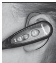
Wrap earhook around the back of your ear as shown.