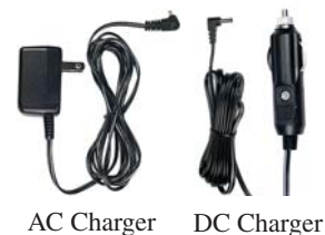
AC Charger DC Charger