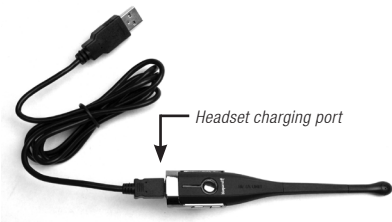
USB Cord & Auto (DC) Charger

Connect charger cord into the headset's charging port. The MFB's indicator light may turn green for several seconds while the headset determines the level of charge the battery is holding. Do not remove the headset from the charger. If the headset is not fully charged, the indicator will turn RED within a short period (less than 3 minutes). When the indicator turns green—and stays green—the unit is fully charged. A fully discharged battery will need approximately 3.5 hours to achieve a complete charge.