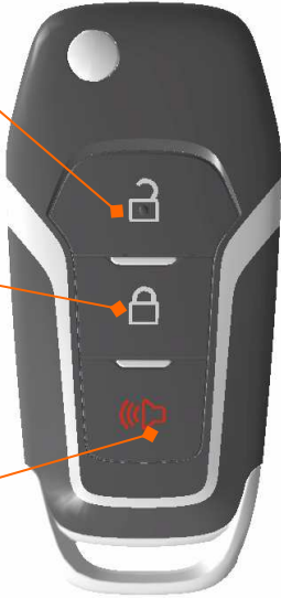
Model A08TAA (3 buttons)