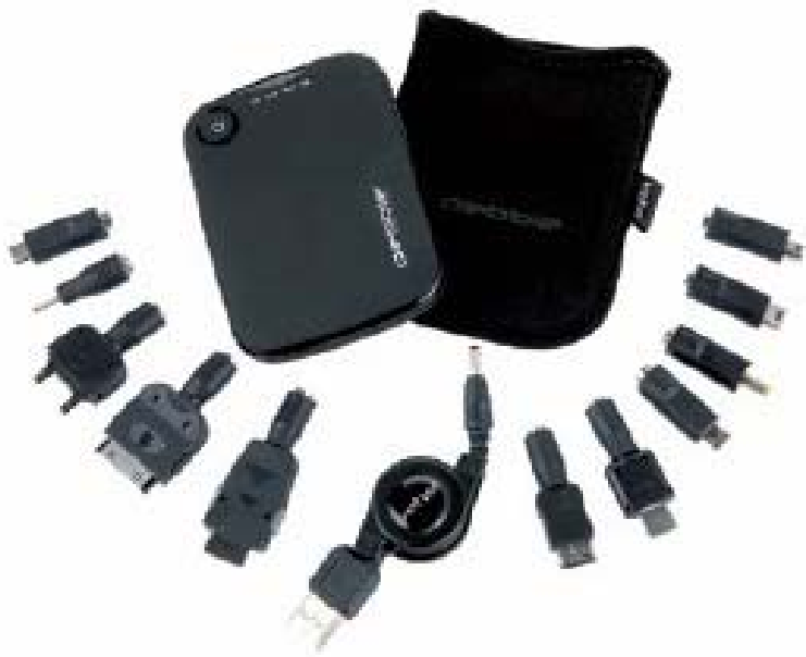
Pebble XT Portable Battery Charger Product code: VCC-A008-PBP-XT