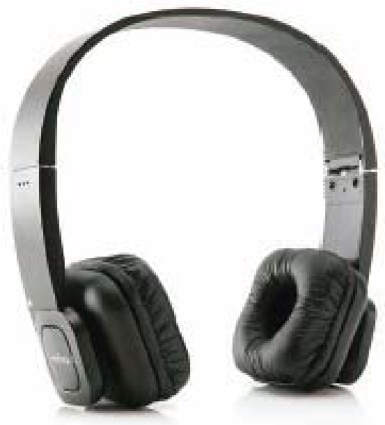
Bluetooth Wireless Headphones Product code: VEP-004-BT