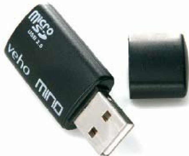
Mino microSD-USB Card Reader Product code: VSD-003