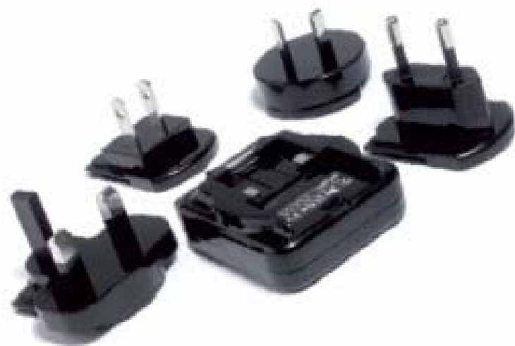
Multi Regional USB Plug Adapter Product code: VAA-005