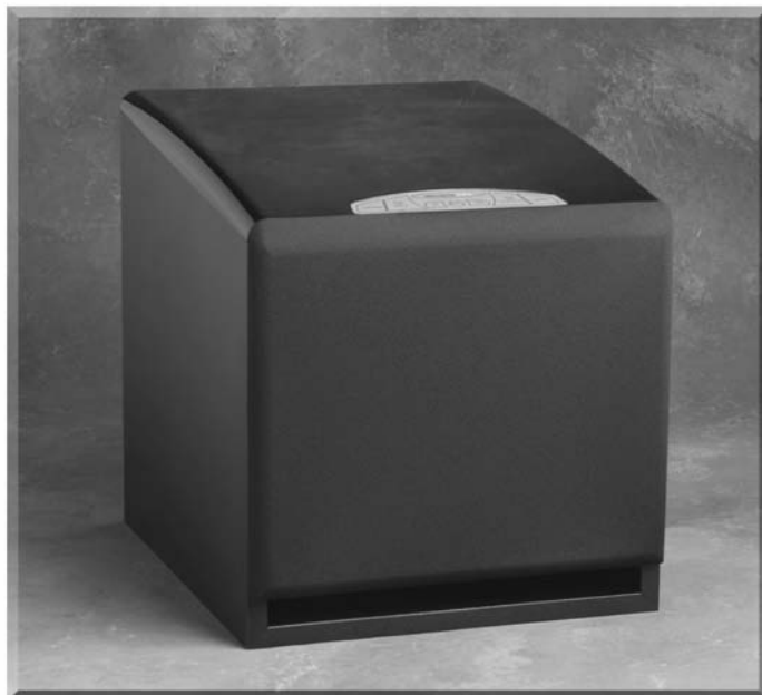
Audio/Video Subwoofer System