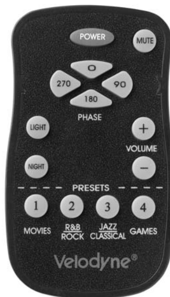
Figure 2: VDR Remote.

Note: The volume can also be adjusted via the buttons on the back panel of the subwoofer. These buttons have the same effect as pressing the up and down volume buttons on your remote. The unit comes preset from the factory with the volume set at 30% of maximum setting.