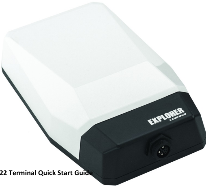
EXPLORER 122 Terminal Quick Start Guide

This quick start guide contains the basic information about getting your EXPLORER 122 Terminal up and running.