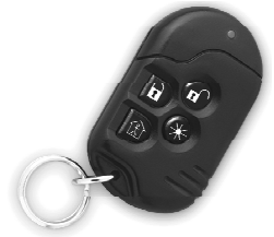
Figure 1. MCT-234

Each transmitter is supplied with a small key ring.