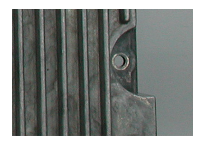
Figure 1: Typical Notch and Eye Construct On Silver Box Casing