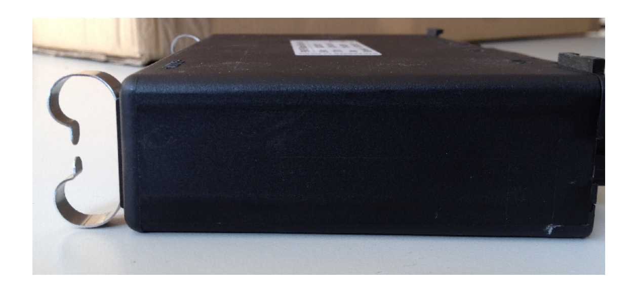
Figure 3: Under-Seat Enclosure For MFA2 Including Retaining Clips