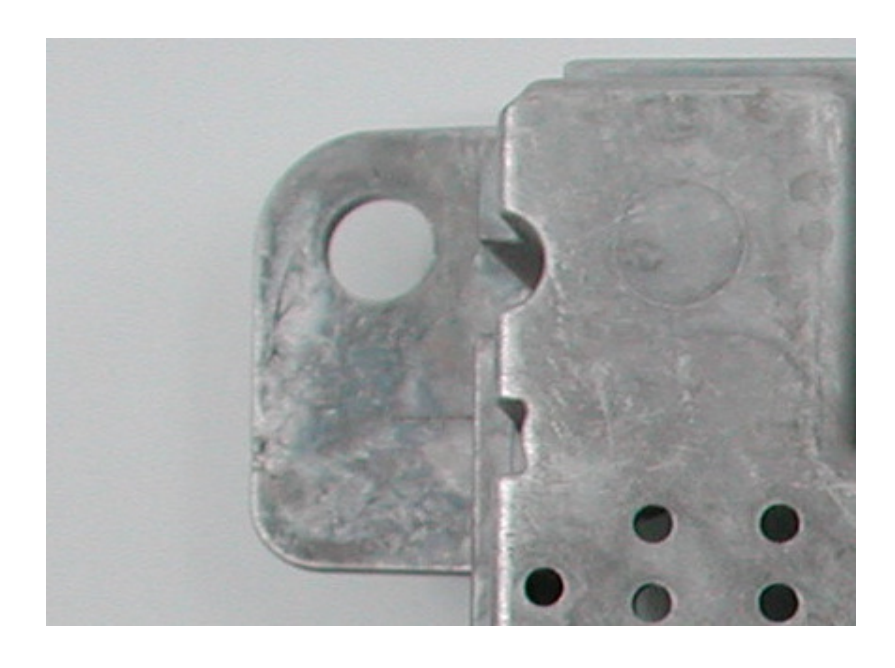
Figure 2: Typical Flange and Eye Construct On Silver Box Casing