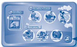
Music On/Off icon

To turn the background music on or off, touch the Music On/Off icon on the cartridge menu.