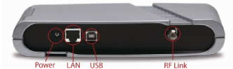
Figure 2-2: V284-A WMU Rear Panel Connectors

There are four connectors located on the rear panel of the V284-A modem.