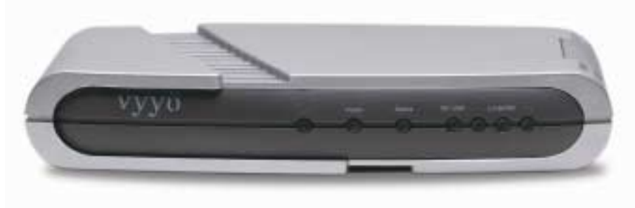
Figure 1-1: The Vyyo V284-A Wireless Modem Unit

Welcome to the User's Guide for the Vyyo Inc. V284-A Modem .